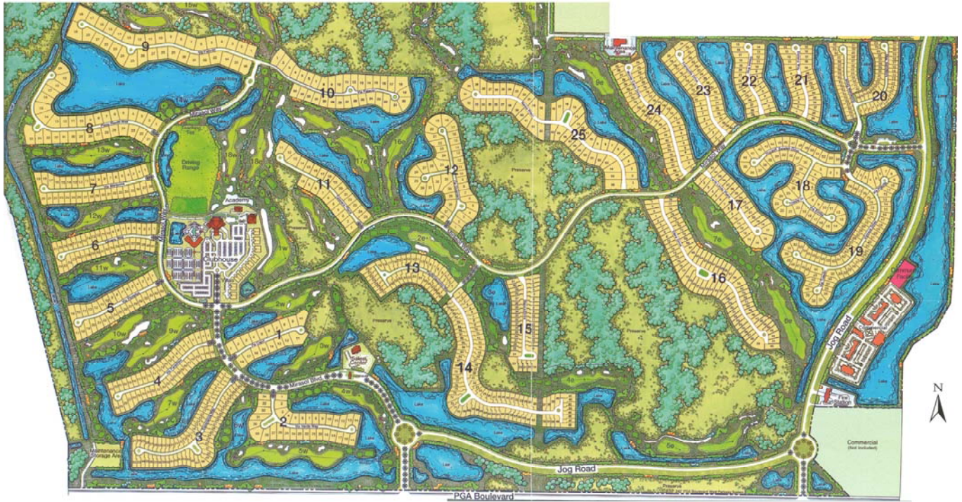
(see pages 3 & 4 for enlarged site plans)